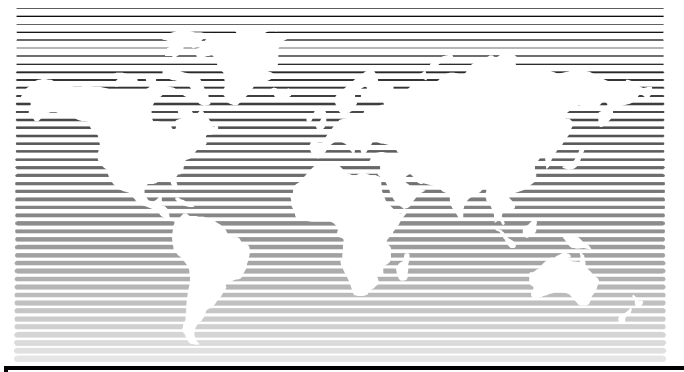
From Across the Pond